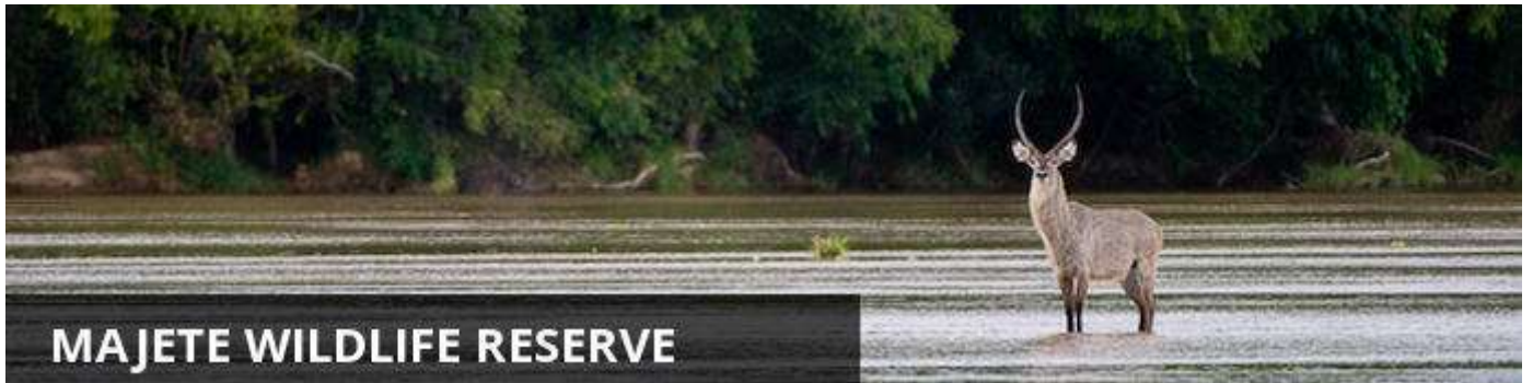
MAJETE WILDLIFE RESERVE